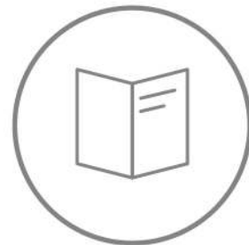
Product Instruction Manual