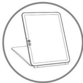
LED Makeup Mirror